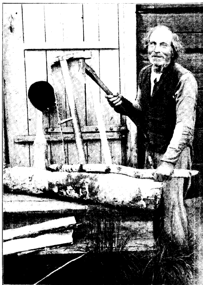
A FINNISH PEASANT.