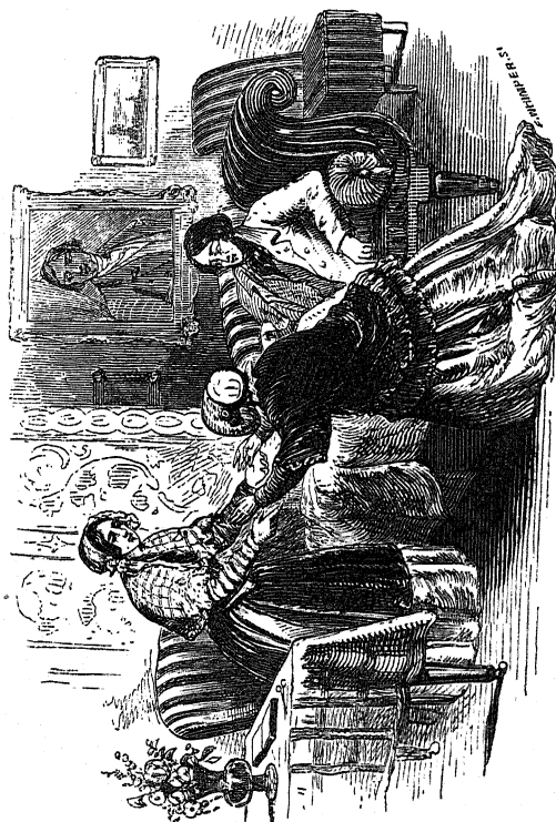
"I have come to you discarded, accused, condemned." Page 119.