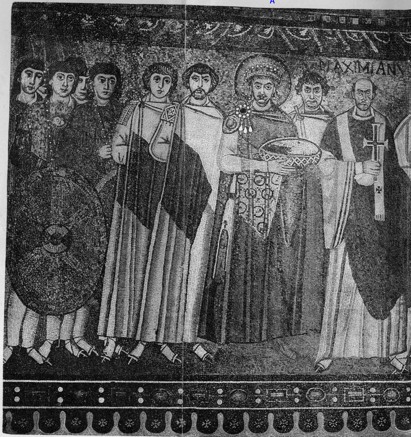
Justinian and his Courtiers; from a contemporary Mosaic in the Church of S. Vitale a