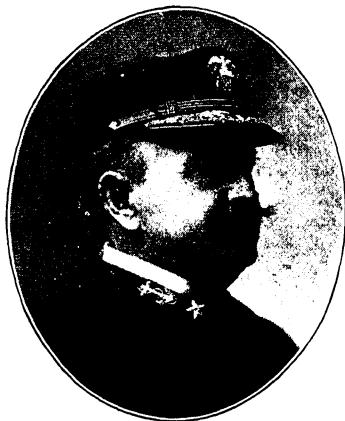
JOHN W. PHILIP

COMMENDED BY ADMIRAL J. W. PHILIP The American Naval Officer