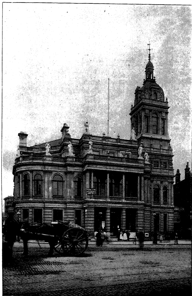
STRATFORD TOWN HALL.