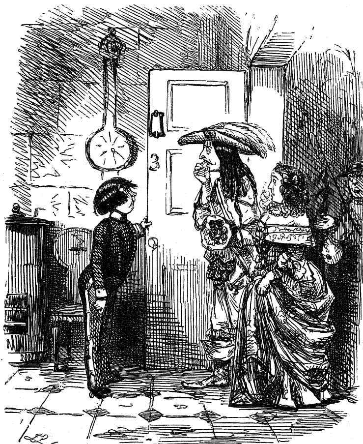
A LATE ARRIVAL.

Page. "FANCY BALL, SIR! NO, SIR! MISSUS'S FANCY BALL, SIR, WERE LAST TOOSDAY, SIR."