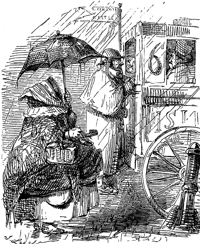
THE TEST OF GALLANTRY.

Conductor. "WILL ANY GENT BE SO GOOD AS FOR TO TAKE THIS YOUNG LADY IN HIS LAP?"