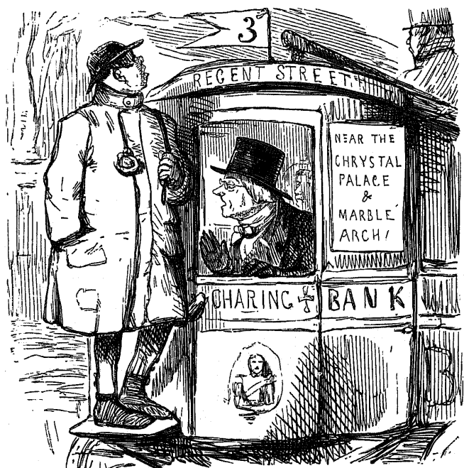
DID YOU EVER?

Old Gent. "NOW, THEN, CABMAN, HOW MUCH TO THE STRAND?" Cabman. "SIX SHILLIN'!" Old Gent. "THAT'S TOO MUCH." Cabman. "WELL: WHAT YOU PLEASE! IT'S TOO HOT TO DISPUTE ABOUT TRIFLES."