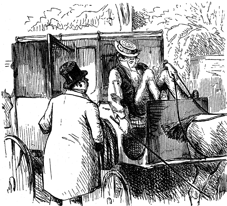
TAKING IT COOLLY.

Old Gentleman. "I WANT SOME SHAVING SOAP, MY GOOD LAD." Boy. "YES, SIR, HERE'S AN HARTICLE I CAN RECOMMEND, FOR I ALWAYS USE IT MYSELF!"