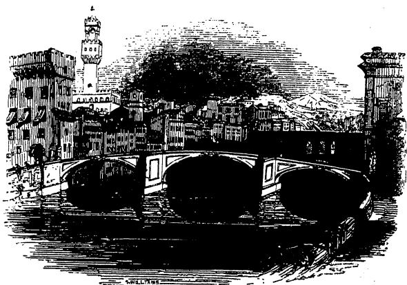
PONTE SANTA TRINITA, FLORENCE.